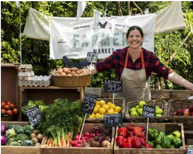
Figure 3. High quality customer service helps producers stand out.

many pounds of beans can I get for you today?” and “Would you like the green peppers or the red peppers or both?”