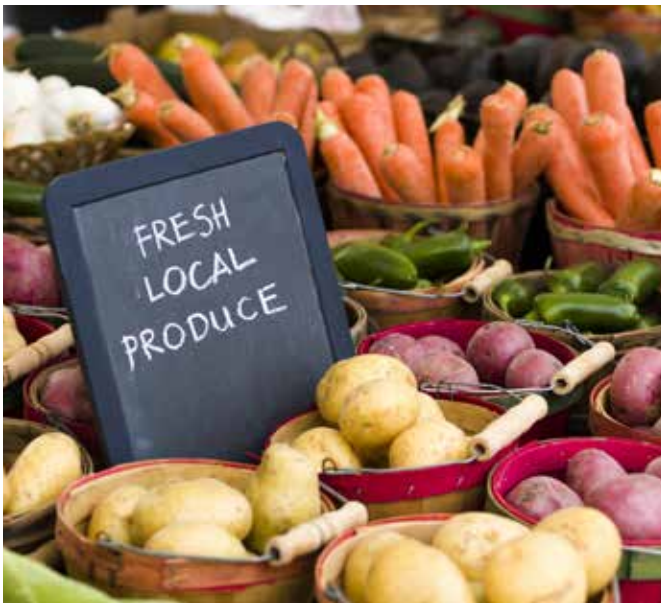
Figure 1. Fresh, local produce sold at a farmers market.

The selling techniques described in this guide are customer-friendly and ethical. The guide provides practical advice on how to increase sales by building a loyal customer base. Its approach to selling — adapted from the book Win-Win Selling (Wilson Learning Library, 2003) — takes readers through a four-step selling process: (1) build relationships with customers, (2) discover customers' needs and preferences, (3) advocate for one's products and (4) provide quality service. Much of the information centers on selling face-to-face at farmers markets. In addition, a number of tips are appropriate for those who sell their products directly to consumers at roadside stands and to chefs and other food service professionals.