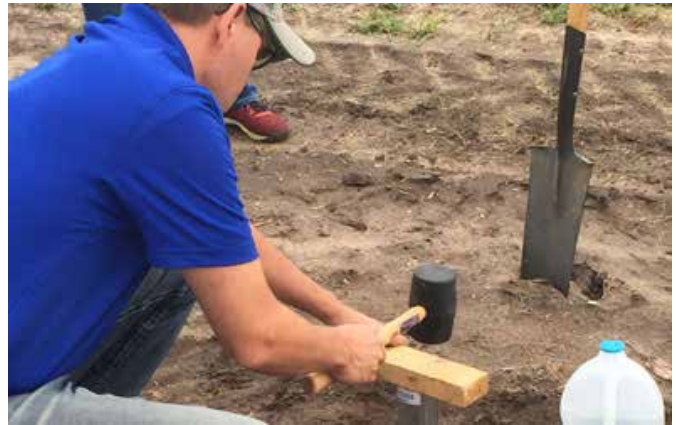
Figure 2. One of the methods for soil health sampling is to use a steel bulk density ring that is pounded into the ground with a block of wood and mallet, then the ring and soil sample is removed with a shovel. This method preserves the inherent structure of the soil, allowing bulk density to be measured, and also provides a good quality sample for other soil health tests.

Different sampling equipment may be used, such as a soil probe (commonly used in fertility sampling) or soil rings. For the Missouri Soil and Water Conservation