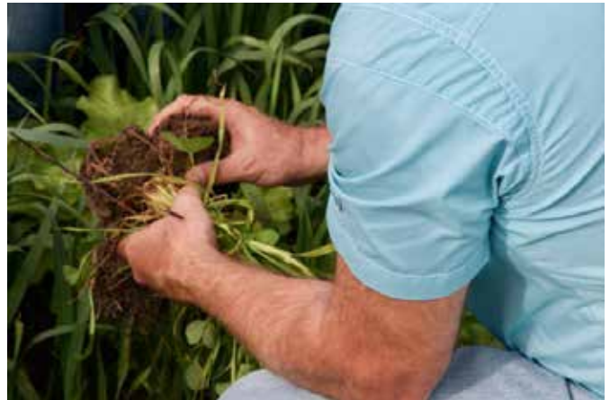
Figure 1. Farmers are increasingly interested in understanding how to measure the health of their soils, especially the impact of management changes such as cover crops.

Most people in agriculture are familiar with collecting soil samples for a standard soil fertility test, but there are considerations to keep in mind to successfully collect soil health samples. Soil health sampling is different