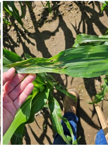
Insect Damage (Armyworm?)