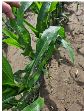
wind or hail damage?

Leaf ripping due to possible wind or hail.