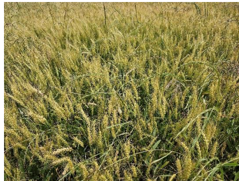
ryegrass in wheat