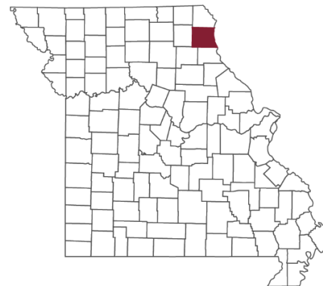
County population: 9,945