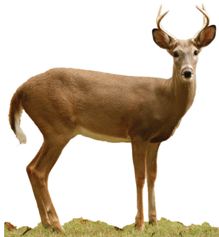
Figure 2. A 1½-year-old buck is often referred to as a doe with antlers.

Also, yearlings tend to be less cautious and will often enter openings before mature bucks.