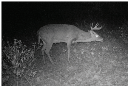
Figure 1. Trail camera photos allow hunters to estimate age of bucks before hunting.

The ability to age live deer, or deer “on the hoof,” is a beneficial skill for all deer hunters and managers. Many hunters and landowners are implementing quality deer management (QDM) approaches into their management activities or have an interest in increasing their opportunity for harvesting larger bucks. Both goals depend on allowing younger bucks to mature into older age classes. Deer management success can be increased by the ability to age live deer. By being able to recognize that a buck has the characteristics of an immature, or younger, deer, a hunter can pass on harvesting that buck so it will have the opportunity to mature to an older age class. This guide provides information on body characteristics of deer in various age classes for use in making management decisions while hunting or while evaluating trail camera photos (Figure 1).