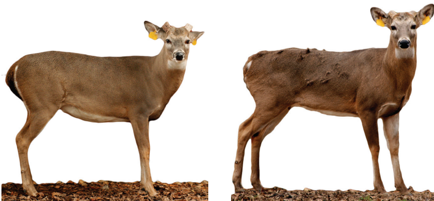
Figure 7. These photos depict the same buck (left) before the rut, when in great physical condition, and (right) after the rut, when fatigued from breeding activity.

Most bucks experience their best body condition during the pre-rut, as they have just spent all spring and summer in bachelor groups foraging on ample amounts of high-quality foods (Figure 7a). Regardless of maturity, many bucks will not exhibit a swollen neck at this time because it is too early before the rut.