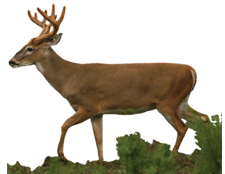
Figure 4. A 3½-year-old buck has a toned body.

Bucks in the 3½-year-old age class are typically described as having a