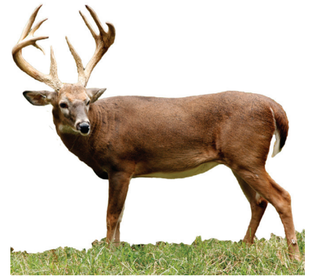
Figure 6. A 5½-year-old or older buck is considered mature.

95 percent of their maximum potential by 5½ years old and 100 percent by 6½ years old. Older bucks can appear younger because their bodies tend to decline in mass. Most bucks in the wild do not survive to this maturity level due to hunting pressure. In general, an older buck’s antlers are more asymmetrical and slowly decline as the buck continues to age.