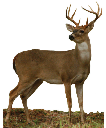
Figure 8. During the rut, mature bucks often exhibit swollen necks.

Most bucks are still in good physical condition at the beginning of the rut. However, as the rut progresses and bucks fight for dominance and breeding, body wear and antler breakage become more common. The rut is when bucks exhibit swollen necks (Figure 8). Bucks lose weight