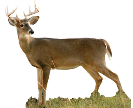
Figure 3. A 2½-year-old buck’s legs still appear long for its body, but its body is thicker than a yearling’s.

Bucks in the 2½-year-old age class typically have slightly thicker bodies than yearlings, but their legs still appear long (Figure 3). They have thinner necks when compared to older age classes of bucks, although their necks may slightly increase in size during the rut. On average, 2½-year-old bucks have reached about 60 percent of their maximum antler size.