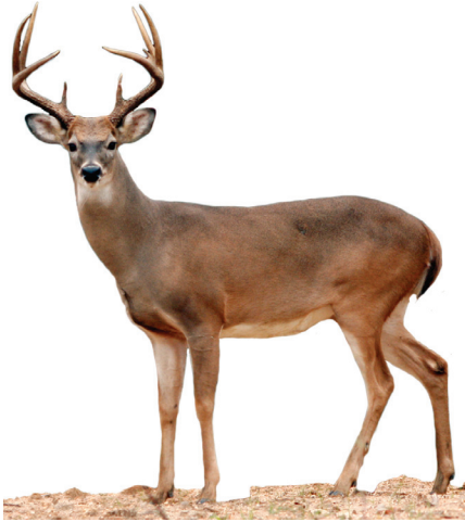
Figure 5. A 4½-year-old buck will have reached about 90 percent of its antler size potential.

“thoroughbred” appearance due to their toned body characteristics (Figure 4). A buck in this class has a muscular body, a chest that is slightly deeper than its rump, and a taut stomach. During the breeding season, a 3½-year-old exhibits a moderately swollen neck. On average, 3½-year-